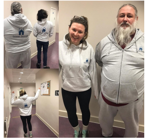
Staff hoodies courtesy of The Tudor Trust