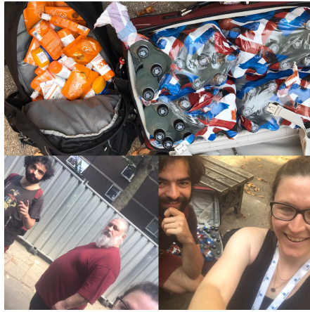
Emergency Outreach in 32 degrees